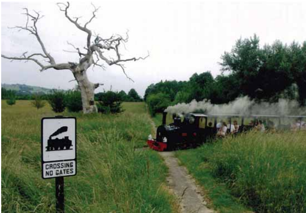
A public footpath crosses a narrow gauge private hobby railway at an ungated level crossing in the South of England.