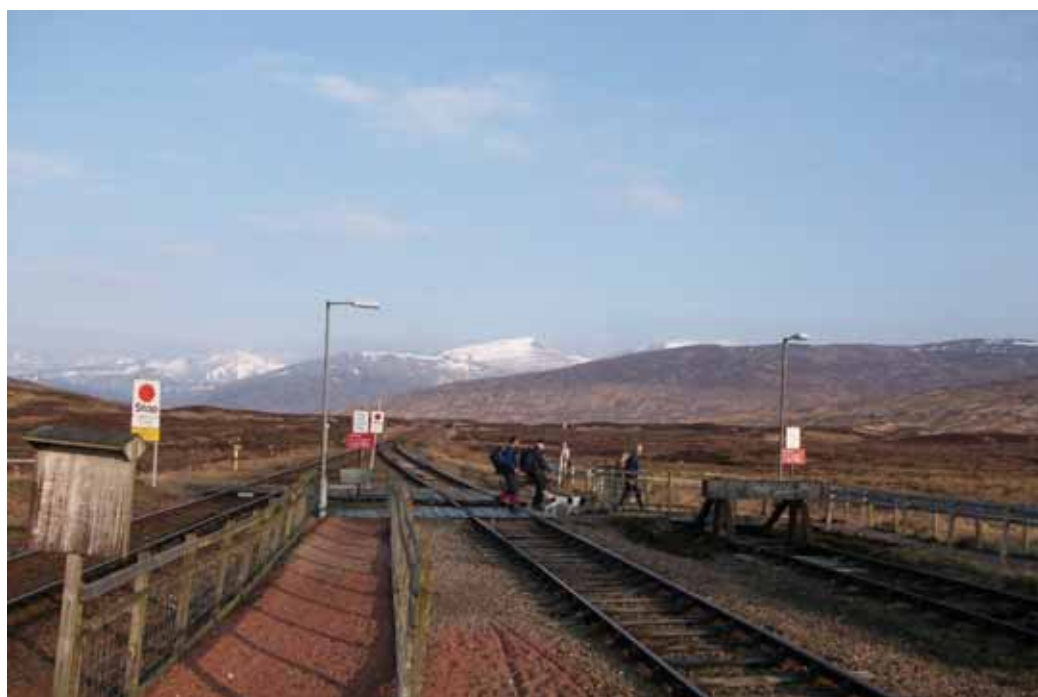
A private footpath crosses the West Highland line at the user-worked level crossing (UWC) at Corroul station on Rannoch Moor.

12.55 A further issue relates to the interaction of the law of level crossings with the law of prescription. This issue relates to whether a public right of way can come into being across a railway by force of prescriptive use. It arises in practice mainly where there is in physical existence a level crossing which is, or at least was, a private one but there has been use by the public for more than 20 years. Has the private right of way morphed into a public one? Or, in other words, has there been a prescriptive upgrade? Any claim that a public right of way has been created would need to get over two hurdles. One is the hurdle of the general law of prescription, and the other is the set of specialities relating to railways.