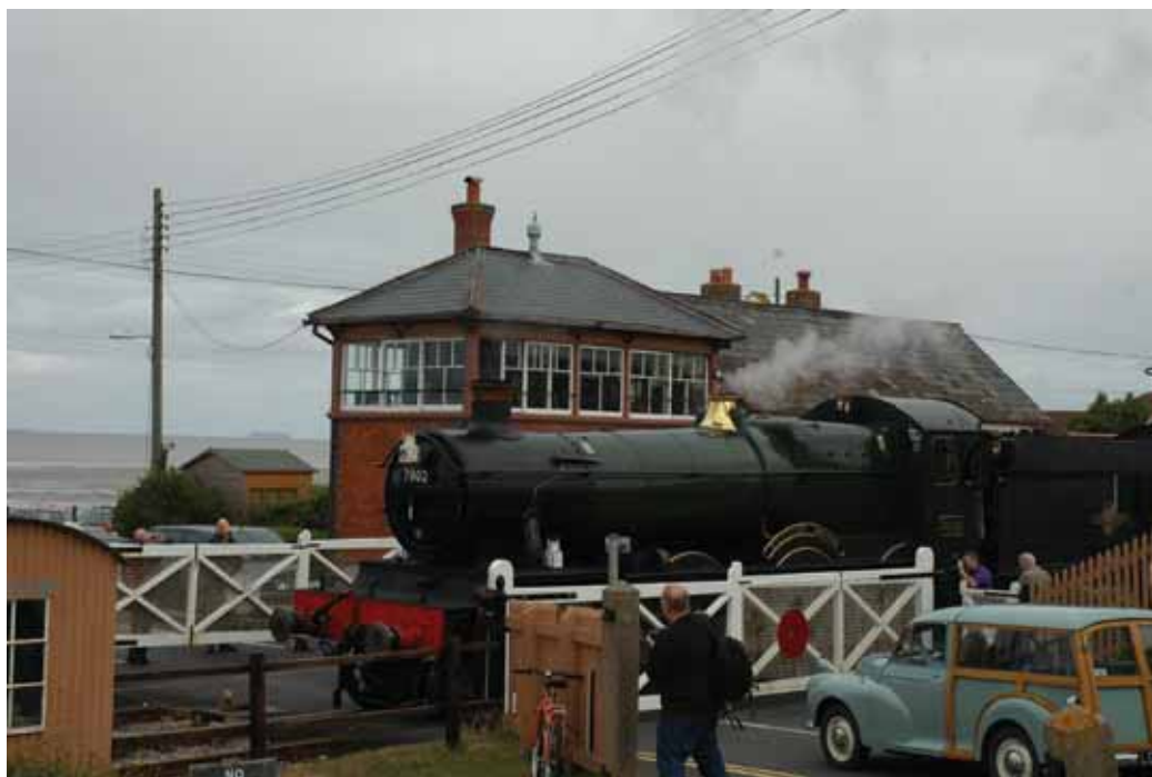
A traditional level crossing on a heritage railway: Blue Anchor station on the West Somerset Railway.

question of the relative priority of road and rail traffic at level crossings. Many of the special Acts provided that gates should be kept shut across the railway. 28 However, as trains became faster and more frequent, the practice of closing the gates across the railway line was found to cause delays. The problem was remedied by the Railway Regulation Act 1842 which provided for gates to be kept closed across roads instead of across the railway.