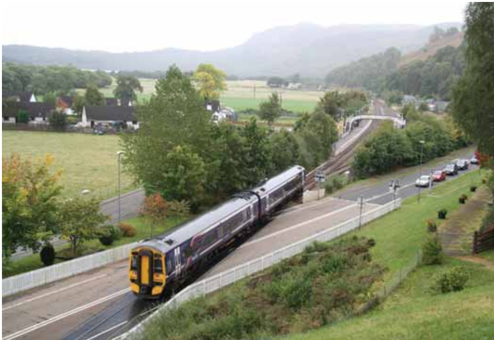
The automatic open (ungated) locally monitored level crossing (AOCL) at Garve station on the Inverness to Kyle of Lochalsh line seen from the hillside.