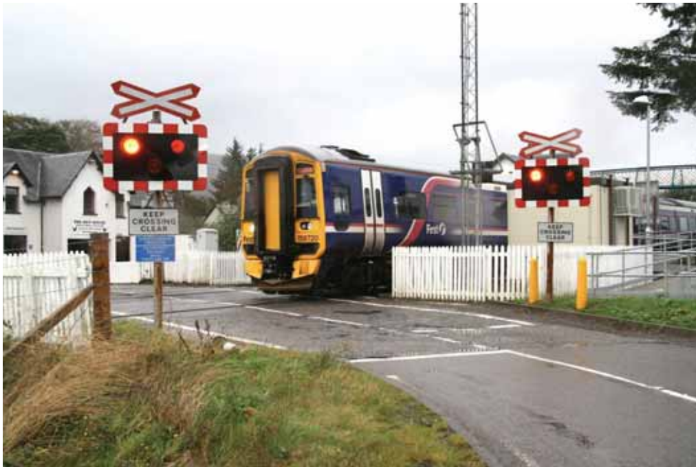
The automatic open (ungated) locally monitored level crossing (AOCL) at Strathcarron station on the Inverness to Kyle of Lochalsh line: note the flashing lights.